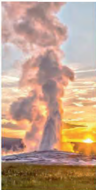
YELLOWSTONE AND JACKSON HOLE