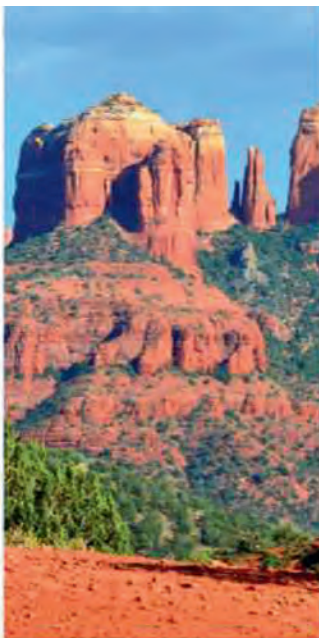
SEDONA'S RED ROCKS & THE GRAND CANYON