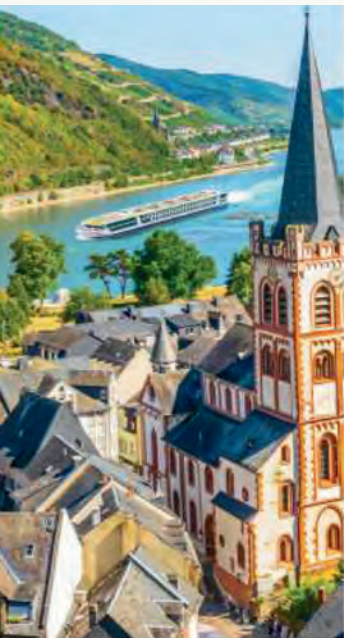
TULIP TIME ON THE JEWELS OF THE RHINE