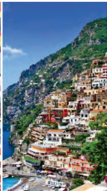
ITALY FROM SORRENTO TO ROME