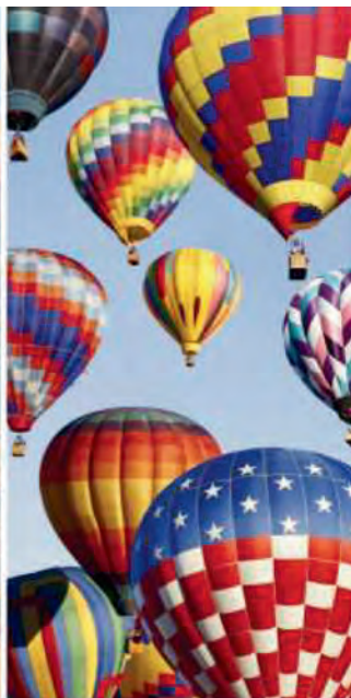
ALBUQUERQUE BALLOON FIESTA